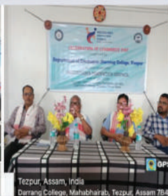
Tezpur, Assam, India Darrang College, Mahabharata, Tezpur, Assam 784001, India Lat:26.630833°