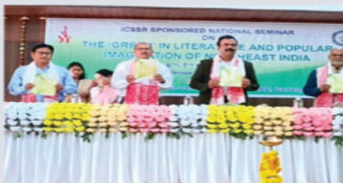
Inaugural ceremony of the National Seminar held on 6 March 2024, organized by the Dept. of English in collaboration with IQAC Darrang College.