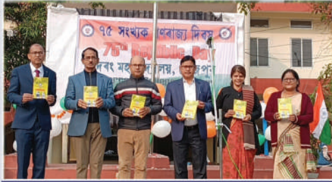
Darrang College "YELLOW PAGE" inaugurated on 26 January 2024.