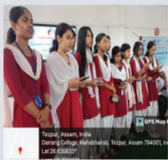
Tezpur, Assam, India Darrang College, Mahabharata, Tezpur, Assam 784001, India Lat:26.630833°