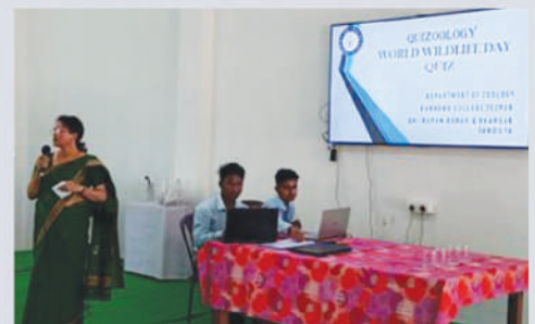
Quizology on the occasion of "The World Wildlife Day 2024" organized by the Dept. of Zoology, on 3 March 2024.