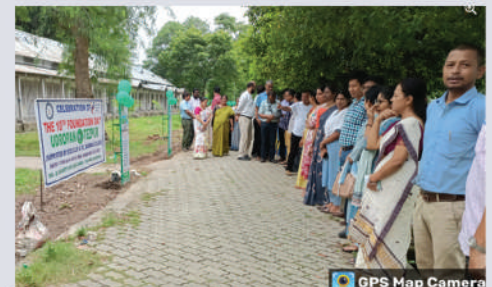
Plantation of Pink Bauhinia (18 Nos.) in the College Campus on the occasion of the 10th Foundation Day (13 June 2024) of Udapan, Tezpur is supported by Eco Club & IIC Darrang College.