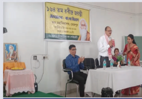
The Dept. of Bengali organized 164th Rabindra Jayanti on 8 May 2024.