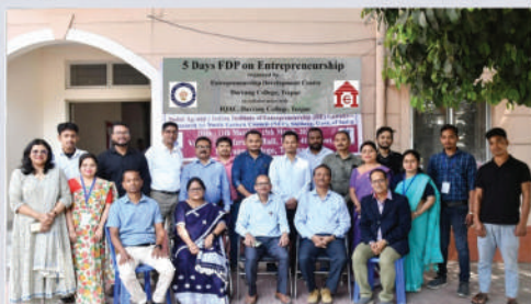
A 5 days (11-15 March 2024) Faculty Development Program on Entrepreneurship is organized by Entrepreneurship Development Centre of Darrang College in collaboration with IQAC of the college.