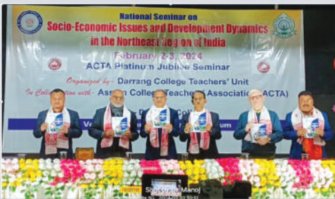
Two days National Seminar inaugurated on 2 February 2024, organized by Darrang College Teachers' Unit in collaboration with ACTA and IQAC Darrang College.