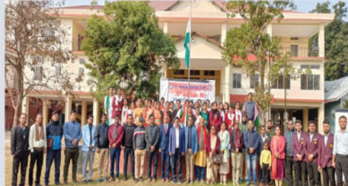
Celebration of 75th Republic Day 2024 at Darrang College.