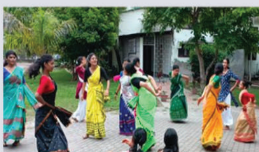
দৰং মহাবিদ্যালয় মহিলা মঞ্চৰ উদ্যোগত অনুষ্ঠিত হোৱা সাদিনীয়া (০৪ - ১০ মে' ২০২৪) বিহু নাচৰ প্ৰশিক্ষণত দৰং মহাবিদ্যালয়ৰ ছাত্ৰী সকল লগতে তেজপুৰৰ বিভিন্ন অঞ্চলৰ ৩৫ গৰাকী প্ৰশিক্ষাৰ্থীয়ে অংশগ্ৰহণ কৰে।