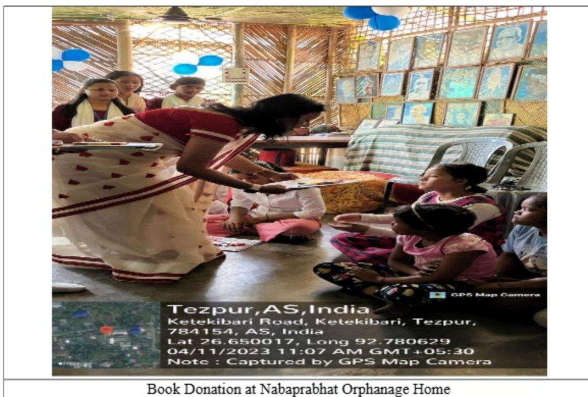
Book Donation at Nabaprabhat Orphanage Home