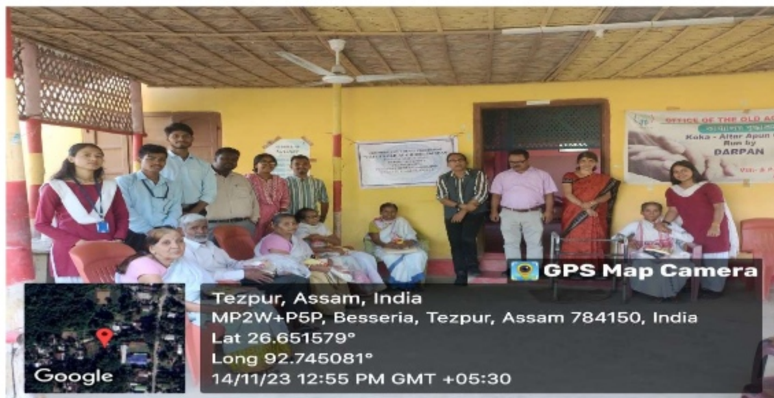
Visited to old aged home (Darpan, Bisseria)