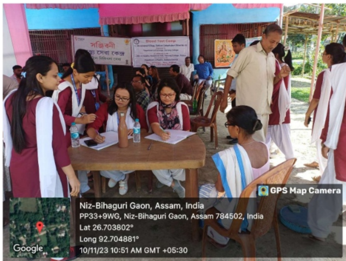
Blood Test Camp