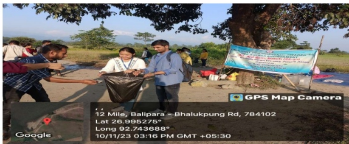
Cleanliness drive near 12 th mile (Nameri National Park)

On 10/11/2023, an extension programmer was carried out by the department along with the U.G. 3rd semester students to clean the picnic spot near 12 th mile area (Nameri National Park). The programs was succeed by the active participation of the faculties and 53 U.G. 3rd students of the department.